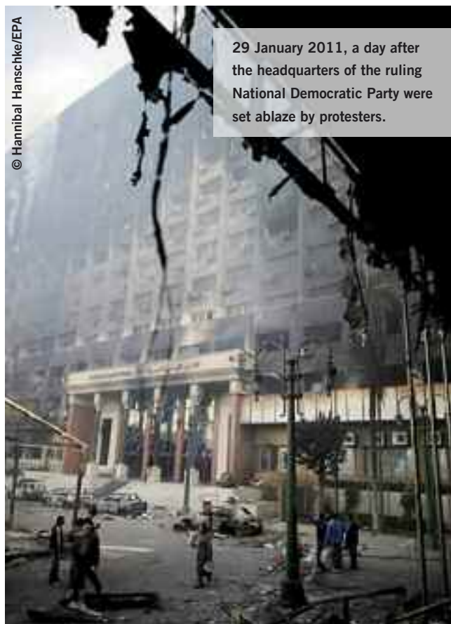
29 January 2011, a day after the headquarters of the ruling National Democratic Party were set ablaze by protesters.