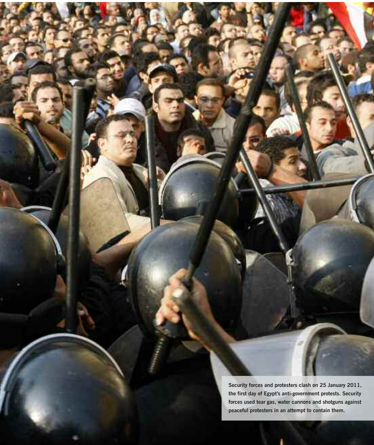
Security forces and protesters clash on 25 January 2011, the first day of Egypt's anti-government protests. Security forces used tear gas, water cannons and shotguns against peaceful protesters in an attempt to contain them.