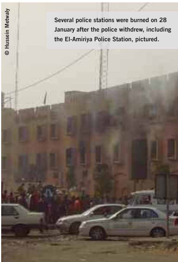
Several police stations were burned on 28 January after the police withdrew, including the El-Amiriya Police Station, pictured.