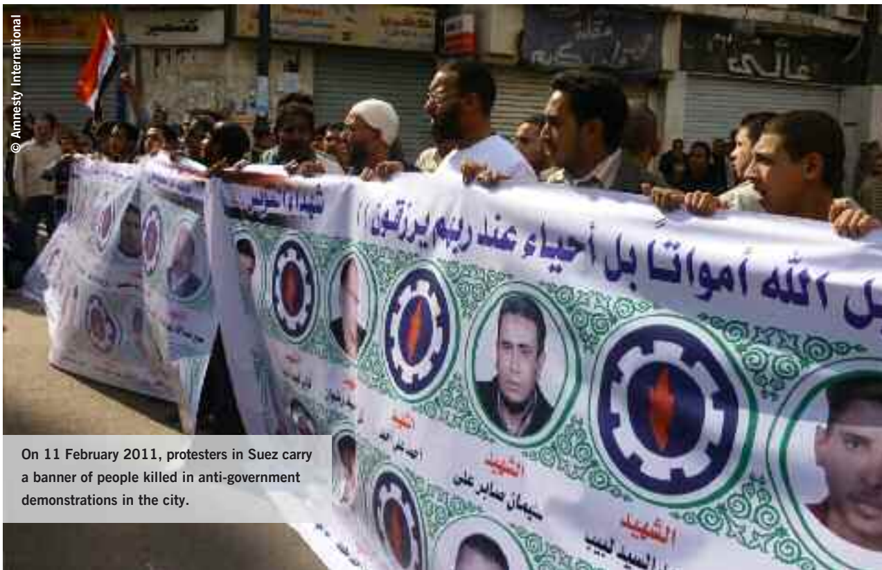
On 11 February 2011, protesters in Suez carry a banner of people killed in anti-government demonstrations in the city.